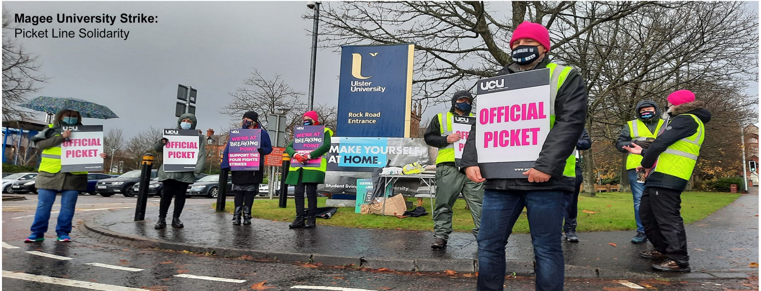
Magee University Strike: Picket Line Solidarity

Industrial Workers of the World (IWW) in Derry have extended solidarity to Derry Dockers at Foyle Port after winning a huge historic victory following strike action on Pay.