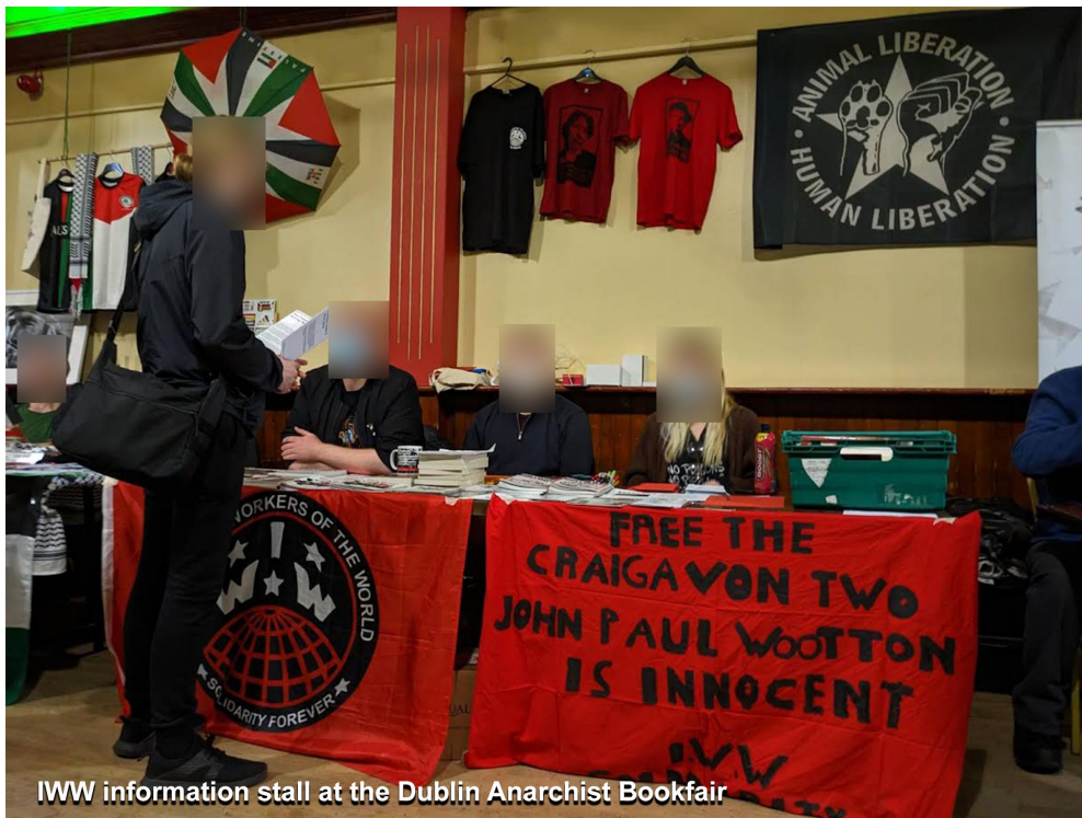
IWW information stall at the Dublin Anarchist Bookfair

The long awaited return of the Dublin Anarchist Bookfair took place in Dublin on Saturday 20th May. After a number of years in cold storage the return to the Teachers Club venue in central Dublin was welcomed by activists throughout the country.