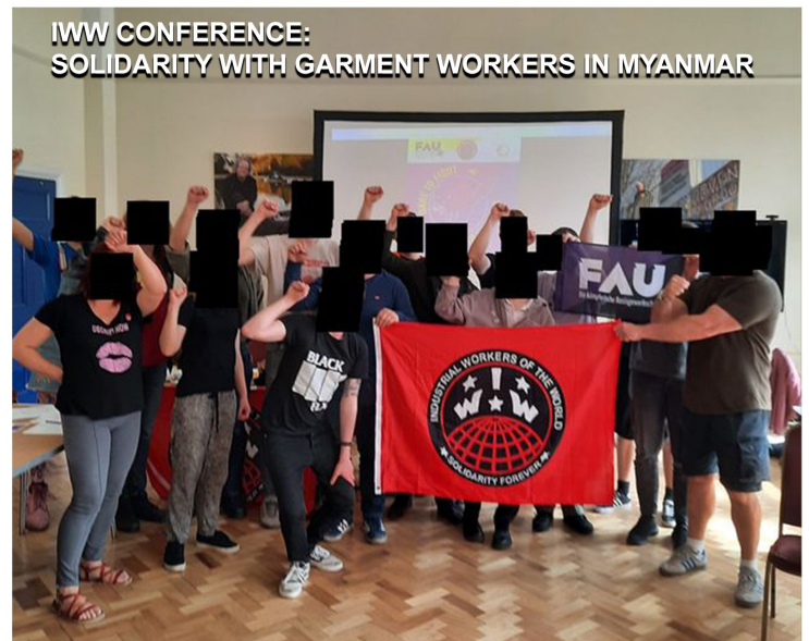
IWW CONFERENCE: SOLIDARITY WITH GARMENT WORKERS IN MYANMAR

Labour rights are inseparable from the current political situation: The military controls virtually all financial traffic within the country, profits from foreign investments, and helps factory managers to crack down on strikes and protests.