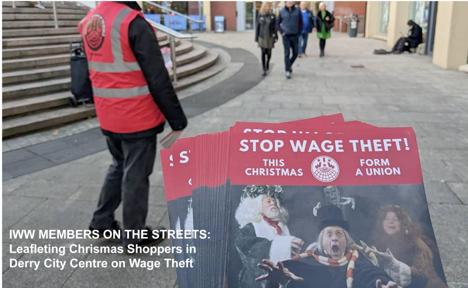
IWW MEMBERS ON THE STREETS: Leafleting Christmas Shoppers in Derry City Centre on Wage Theft

Campaign against Wage Theft continued over the holiday season in Derry to help highlight the continuing attacks on workers within the hospitality sector.